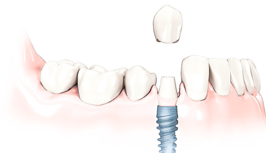
Replacement tooth on implant. Neighboring teeth are left untouched.