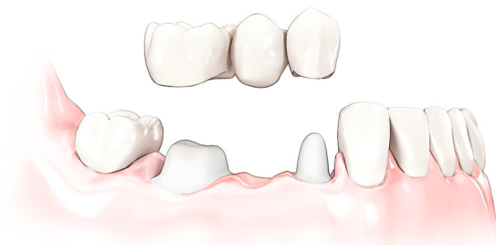
Replacement teeth on natural teeth. Neighboring teeth need to be ground down.

Depending on your individual situation, your dentist can immediately connect the implant to a temporary restoration that looks and feels just like your natural tooth.